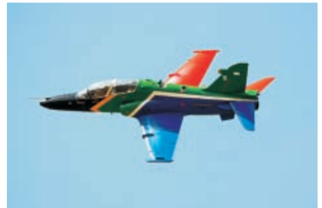
Toeskouers is altyd in hul noppies om die Hawk-stralerlesvliegtuig wat in die kleure van die landslag geveer is, te kan besigtig.