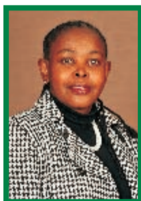
Cllr Morakane Mosupyo Speaker

The City of Tshwane is governed by the Executive Mayor, assisted by ten Members of the Mayoral Committee. The Speaker and the Chief Whip of Council also perform critical roles in managing the Council. Acting as a local Cabinet, their task is to implement the political mandate to improve the socio-economic conditions of residents. The Council of the Municipality consists of 210 elected Councillors, 105 Party Proportional Representatives and 105 Wards Representatives.