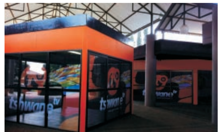
Tshwane TV offices at the Tshwane Events Centre

The channel is scheduled to go on air on 1 June. It will broadcast on a 24-hour basis.