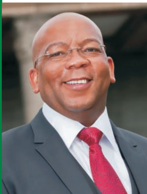
Executive Mayor Cllr. Kgosientso Ramokgopa

The overwhelmingly high turnout of voters in Tshwane during the recent elections was a demonstration of an abiding respect for the democratic ideals enshrined in the Constitution, Executive Mayor Cllr Kgosientso Ramokgopa said in his acceptance speech after being re-elected by the Council as Tshwane's new leader.