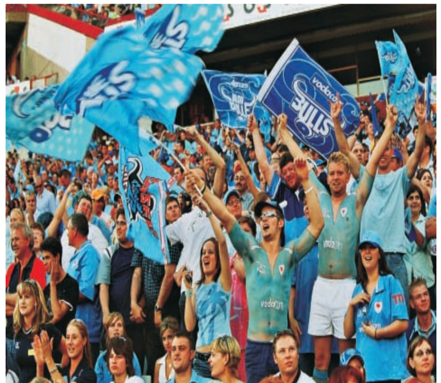
Blue Bulls fans at Loftus Stadium

If the determined and spirited performance last Saturday is anything to go by, Tshwane may well retain the title of being the City of Champions. The City of Tshwane stands behind its rugby team.