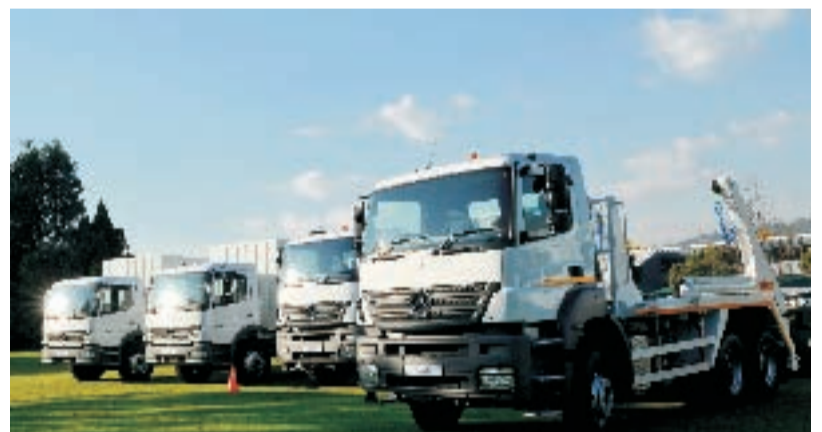
New fleet of trucks acquired from Daimler Fleet Management

"Whilst the new vehicles will ease the current pressure, the efficient deployment of vehicles and management of waste removal operations remain a critical priority."