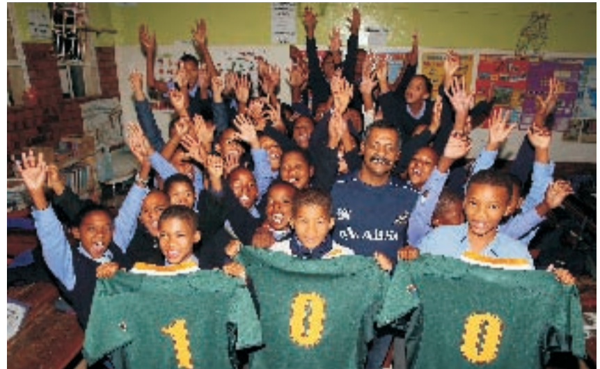
Springbok coach Peter de Villiers launching the 100-day countdown with children at his old school, Klein Nederburg in Paarl.

The defending champions must rise to the occasion to make the country proud once more. The city's Blue Bulls players, led by the towering Victor Matfield, will definitely contribute to the country's success.