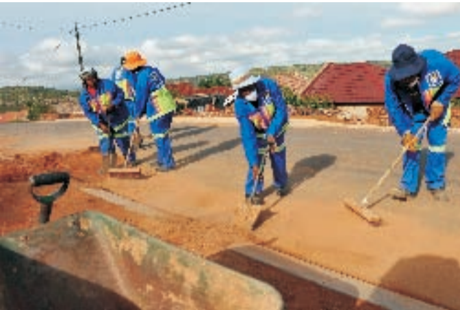
Workers upgrading road infrastructure.

The City of Tshwane has allocated R791 million or 24,85% of its capital budget to