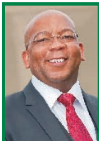
Cllr Kgosientso Ramokgopa Executive Mayor