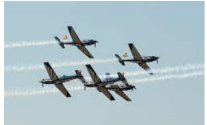
Die skare hou asem op tydens die dramatiese presisievlug deur die Silwer Valke se kunstvliespan.

'n SAA Boeing 737 600 wat deur die Silwer Valke vergesel word, het toeskouers se koppe laat draai by die SA-Lugmagmuseum se lugskou by die Zwartkop-lugmagbasis.