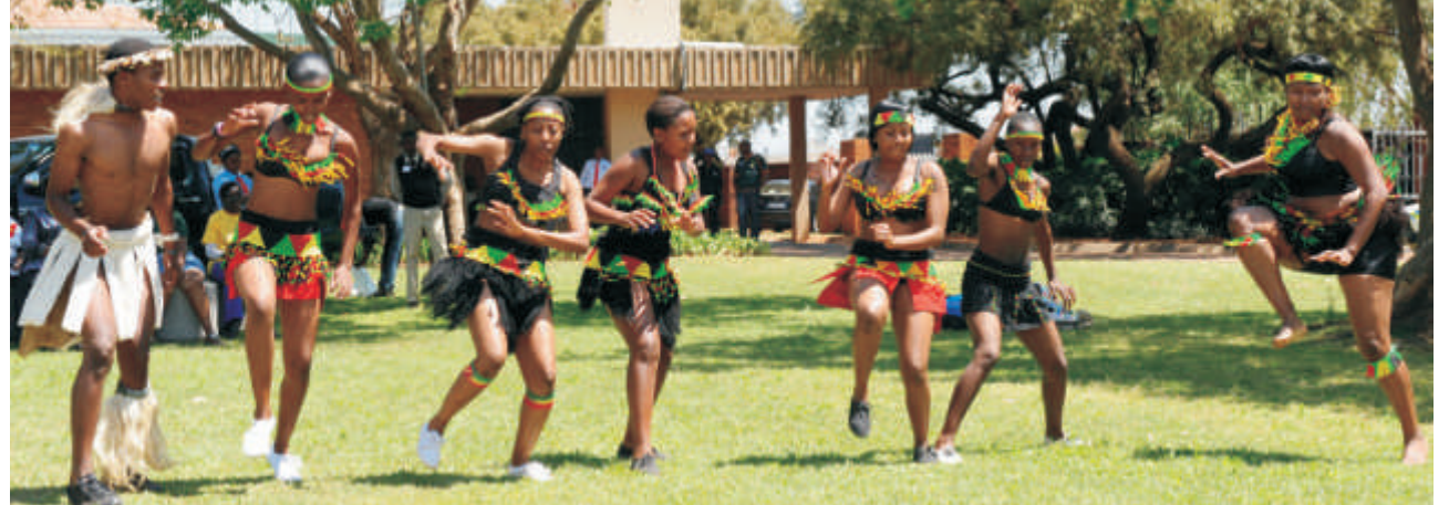
The Mamelodi Ubuntu Theatre Organisation

This award-winning group specialises in dance, drama and poetry. They have performed on big stages in South Africa and Europe. Their major achievement was a drama award they received at the Grahamstown National Arts Festival in 2004.