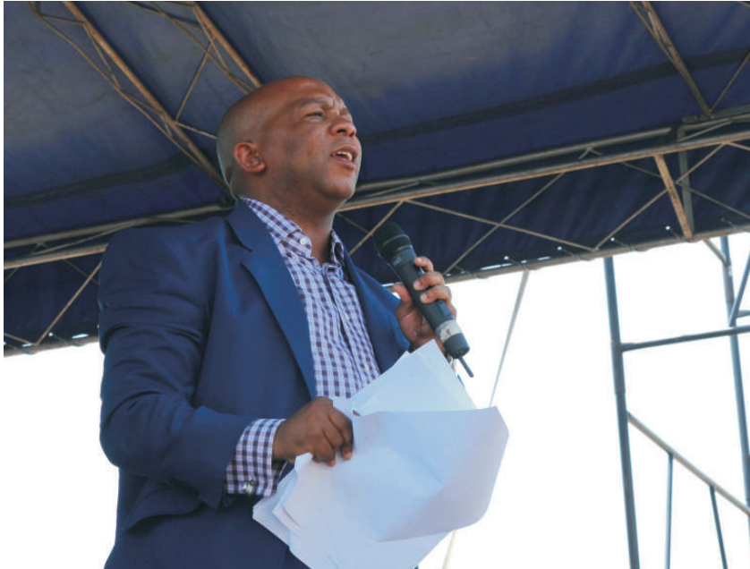
Executive Mayor, Cllr Kgosientso Ramokgopa