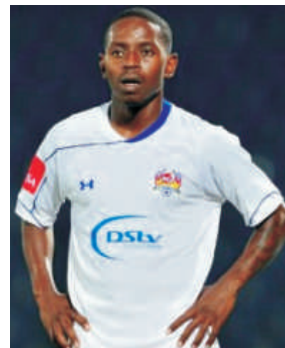
Dipsy Selolwane

Sources: www.psl.co.za / www.supersport.co.za